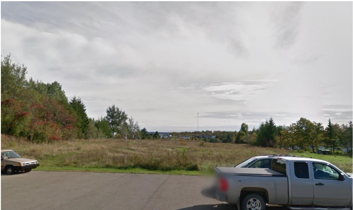
Figure 1: View of Subject Property from North

BACKGROUND: The subject property is located adjacent to Robertson Avaneue, central within the block bounded by Mechanic, Elm, Purdy, and Crossin Streets. The site contains 9,936 m 2 (2.46 ac) and while zoned Park and Open Space (P), it is currently an unmaintained property and not part of the Municipality’s parks programming or future plans (Figure 1). Properties in the immediate area are primarily zoned Lower Density Residential (RLow) with one property zoned Multi-Unit Residential adjacent to the north.