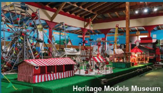
Heritage Models Museum