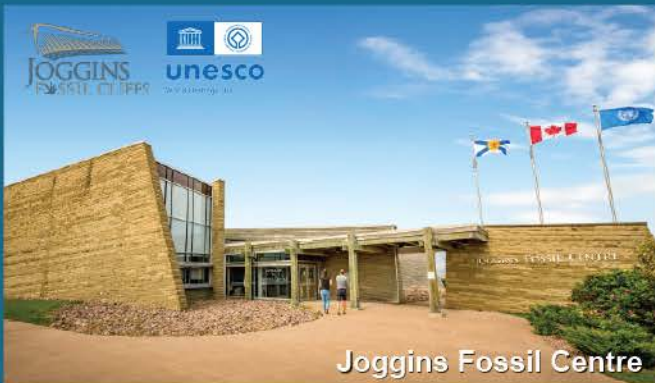
Joggins Fossil Centre