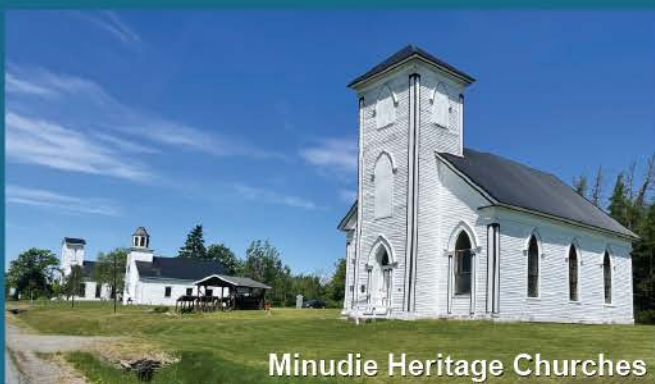
Minudie Heritage Churches