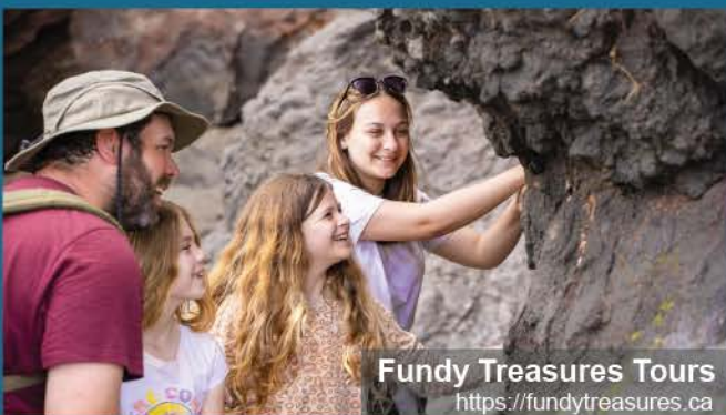
Fundy Treasures Tours https://fundytreasures.ca