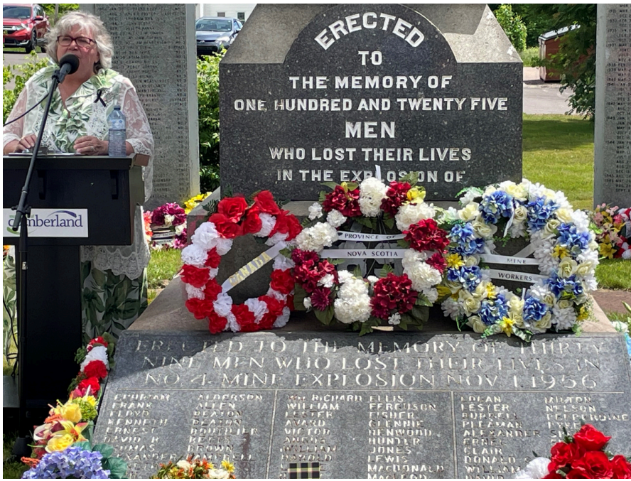
Miners' Memorial Day was June 11 with a ceremony in Springhill.