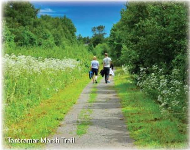
Tantramar Marsh Trail