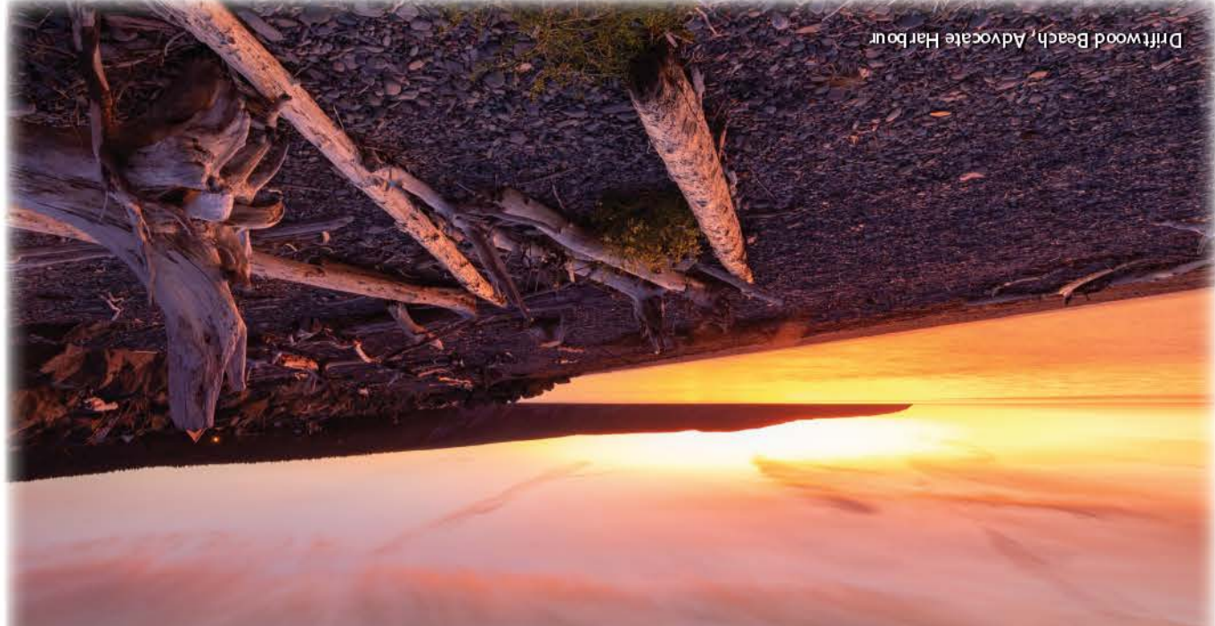
Driftwood Beach, Advocate Harbour