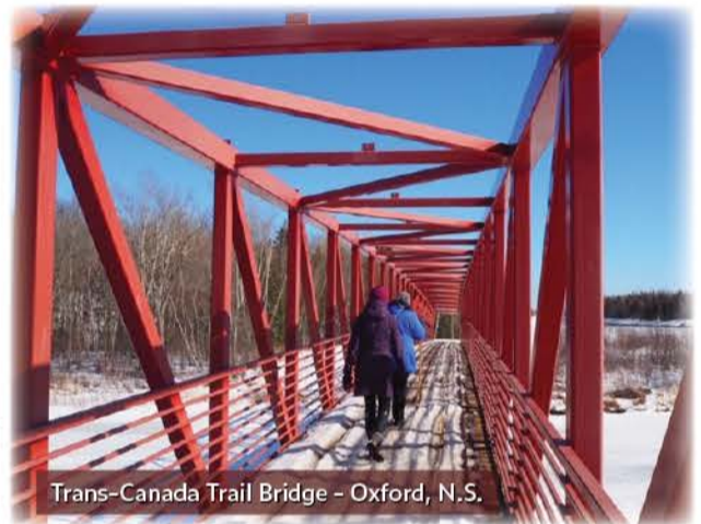
Trans-Canada Trail Bridge – Oxford, N.S.