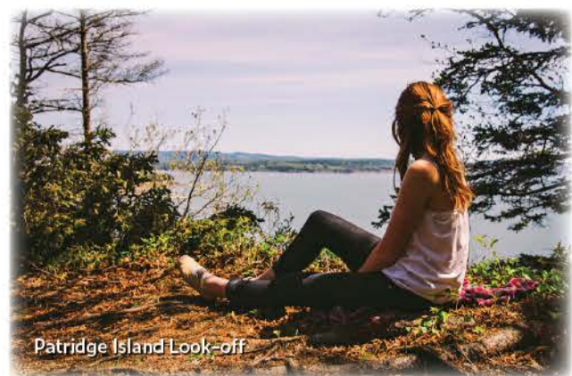
Patridge Island Look-off