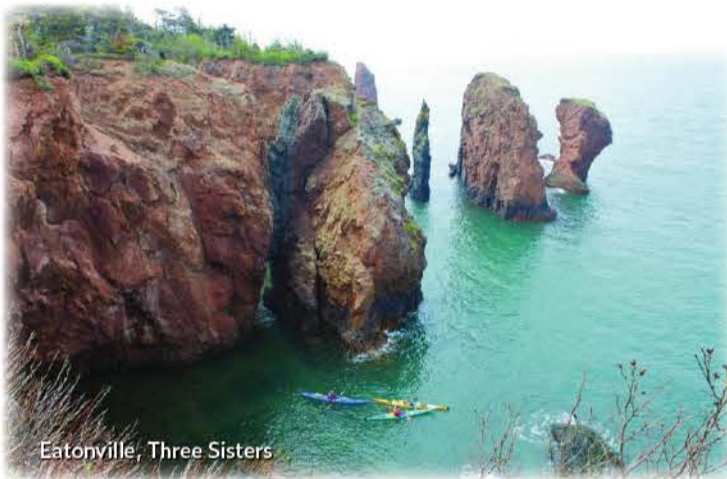
Eatonville, Three Sisters

Waterfalls are abundant in Nova Scotia. Exploring them will take you from one end of the province to the other. So no matter where you are, there's probably one nearby!