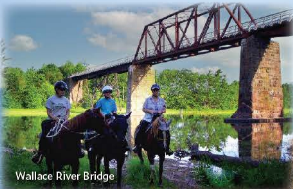
Wallace River Bridge

Cumberland Trails Facebook group, https://bit.ly/2R8LFpB