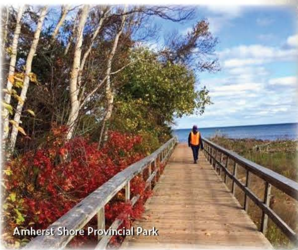
Amherst Shore Provincial Park