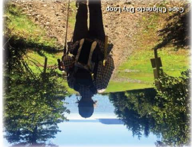
Cape Chignecto Day Loop

This is a 3.7-km, loop trail, good for all skill levels. The trail is primarily used for hiking, walking, running and bird watching. Best used from April through October. Access the trail by turning north on Aboiteau Rd. between Wallace and Pugwash.